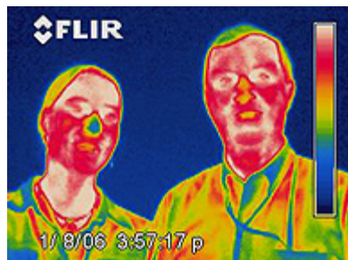
Two Spitzer teachers calibrate themselves in the thermal infrared during meetings of the Spitzer Research Program for Teachers team at the AAS.

Sponsored by NOAO and SSC, this teacher program represents an attempt by NASA and the astronomical community to engage the general public in the experience of exploration and discovery, while also enticing middle and high school students into pursuing careers in science, technology, engineering and mathematics.